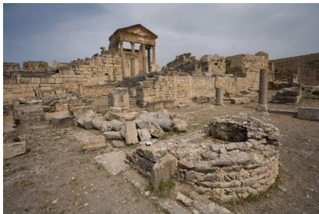
Aghlabid Baths, Dougga, Tunisia.