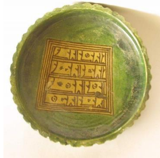
Raqqada, Kairouan, Tunisia Working N°: TN 72