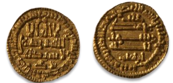
9th cent. Aghlabid Coin

16:10 Discussion Future Plans and Outlook