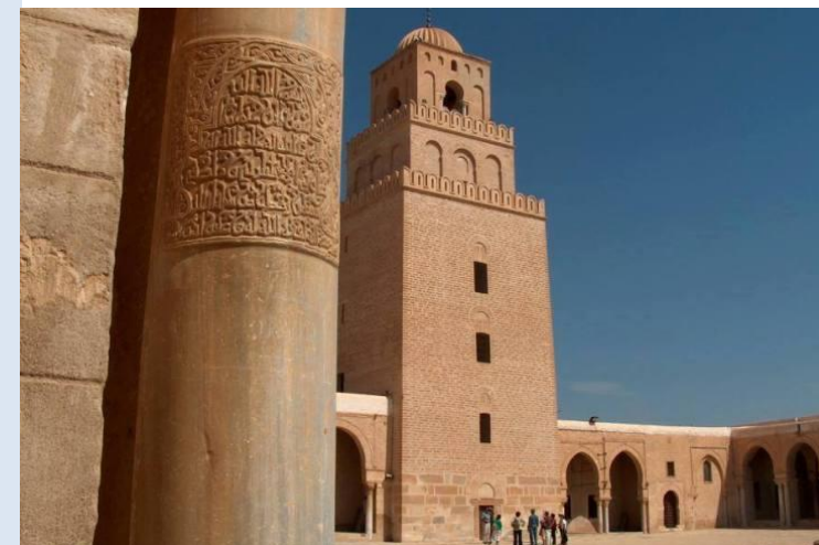
Great Mosque of Qayrawan