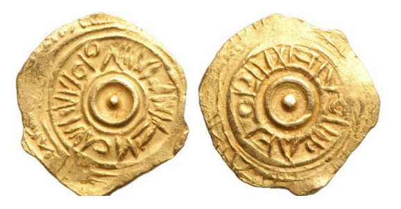
Tari from Amalfi or Salerno

Southern Italy in Trans-Mediterranean bullion flows, 600-1000