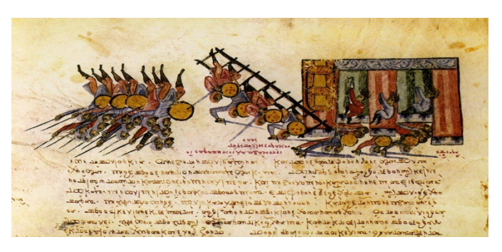
The Fall of Syracuse to the Arab

An Island of Crops, Livestock, and Slaves: A Reconsideration of Sicily's Significance in the Aghlabid Political-Economic Sphere