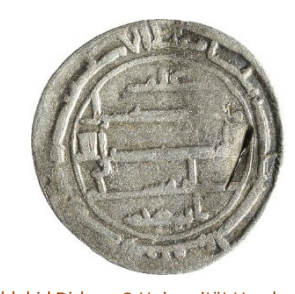
Aghlabid Dirham