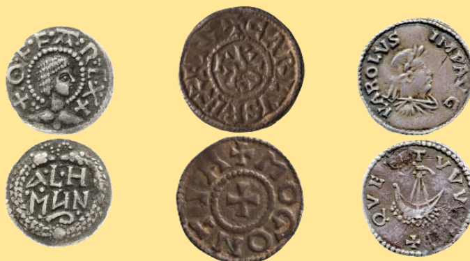
Frankish coins

This workshop explores the role of mining and minting in the western Mediterranean world at the end of the Long Antiquity. It looks at the three large regional and political entities, North Africa, the Iberian Peninsula, and Frankish Western Europe. A special focus is on the spatial, political, and economic dimensions of mints and mines.