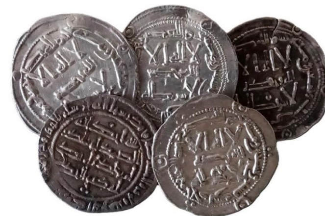
Coins from al-Andalus

RomanIslam – Center for Comparative Empire and Transcultural Studies (Early Islam)