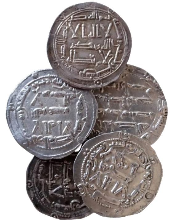
Coins from al-Andalus