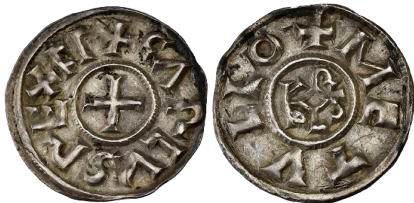
Carolingian Denar, mining mint of Melle